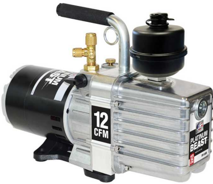
DV-340N PLATINUM BEAST 12 CFM Vacuum Pump