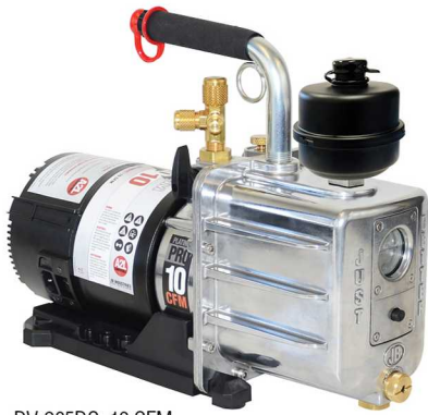
DV-285DC, 10 CFM DV-240DC, 8 CFM