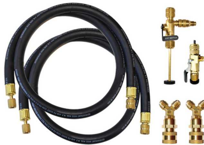
VL-200 ACCELERATOR Rapid Evacuation Kit